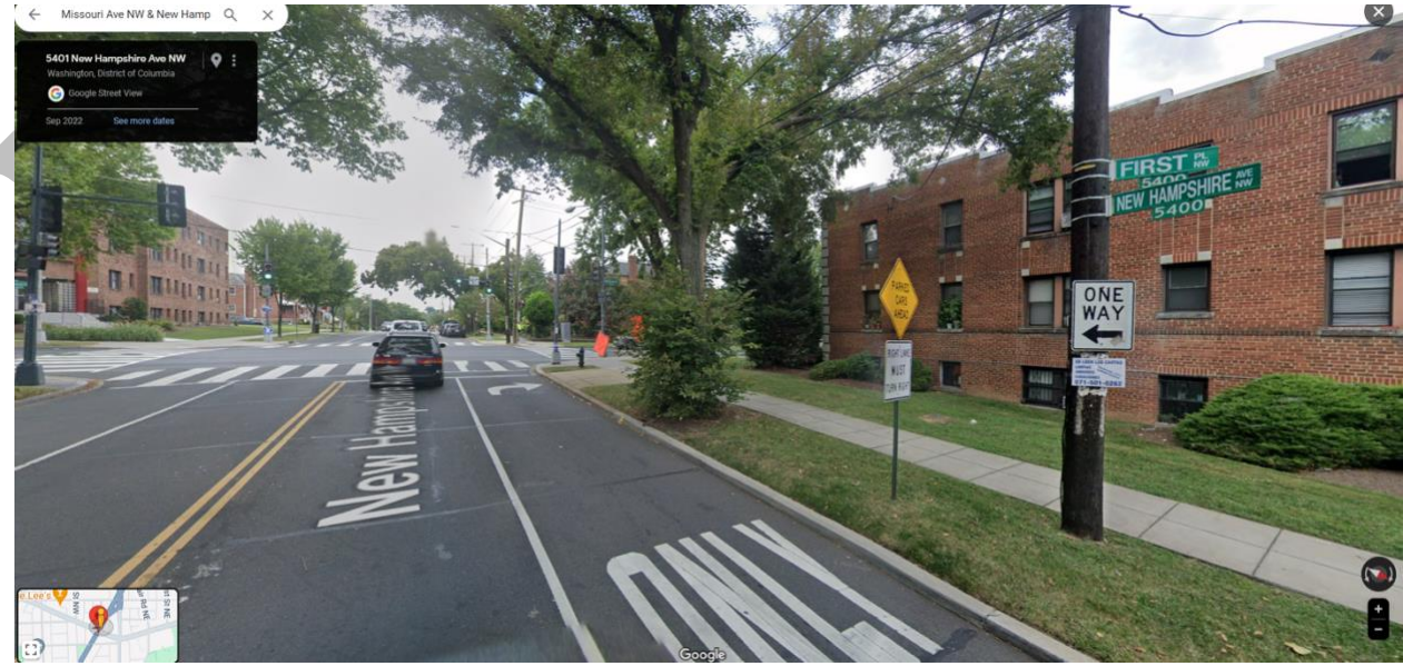
The intersection of Missouri Avenue, NW, and New Hampshire Avenue, NW.